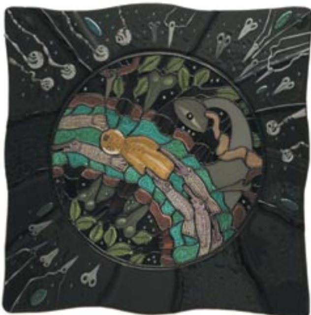
"Kimberley Garfish." Size 780 x 780 mm Technique; Kiln fused and moulded glass, leaded. Date 2007