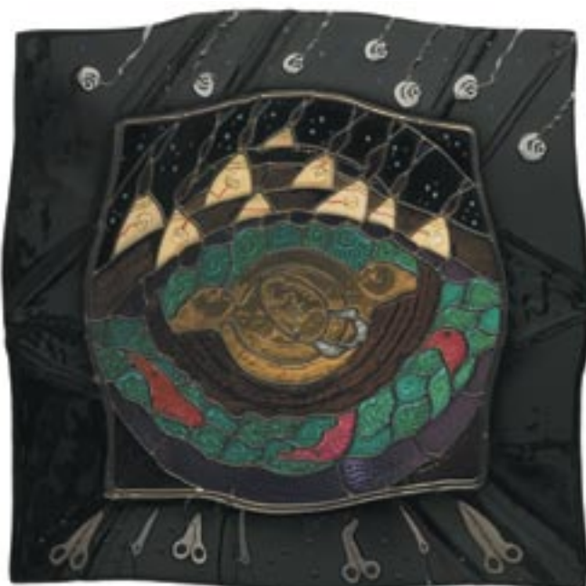
"Birth Boat." Size 750 x 750 mm Technique; Kiln fused and moulded glass, leaded. Date 2007