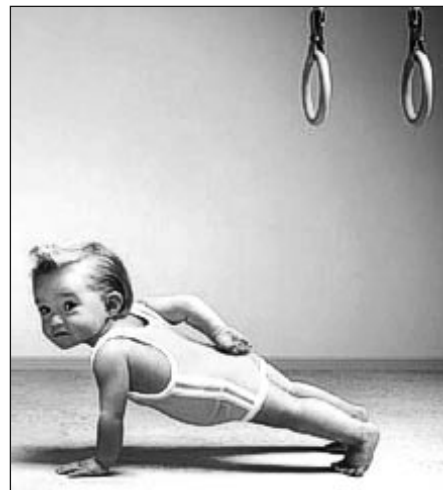
Matan students are encouraged to achieve their potential by innovative methods.